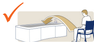
Transfer to Bath