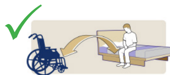
Bed to Chair/Chair to Bed