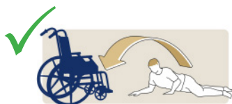
Floor to Bed/Chair