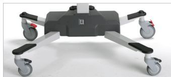
TR 2000 Hydraulic - High chassis and TR 3000 Battery operated - High chassis