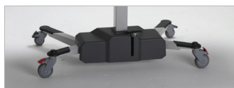
TR 2000 Hydraulic - Back of chassis