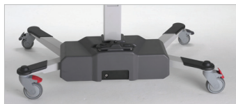
TR 3000 Battery operated - Back of chassis