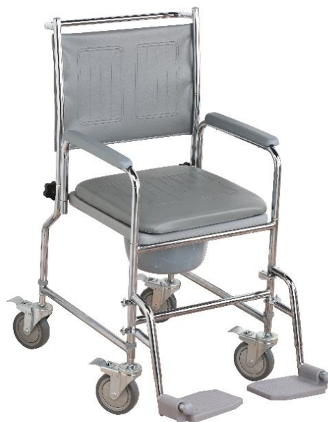
Figure 1 - Model M66119

https://www.nrshealthcare.co.uk/bathroom-aids/toilet-aids/commodos/nrs-wheeled-commode-height-adjustable for an assembly demonstration.