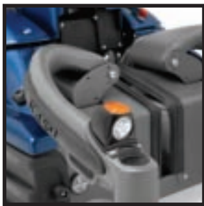
All-wheel suspension system for better balance, improved ride and safety