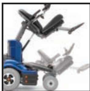
Optional 45° power tilt from any seat position