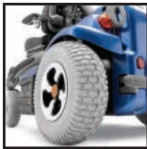
Optional Flat-Free tyres for high performance and low maintenance