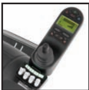
R-Net electronics for improved programmability