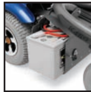
The batteries are easily accessible

ISO 7176-19 / ISO 10542-3 EN12182/EN12184