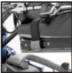
Uni-track system allows for extensive customization