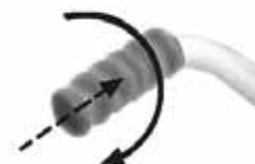
Turn Clockwise to shorten arm