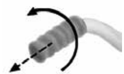
Turn Anti-clockwise to lengthen arm