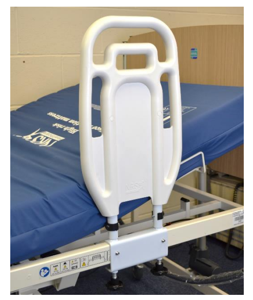
Figure 1 – N72000