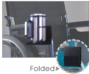
Folded Wheelchair Drink Holder