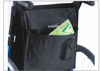
Back rest bag