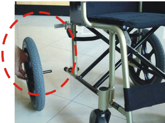
Quick release transit wheels