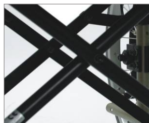
Double cross brace