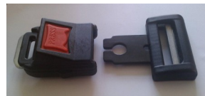
Press Release Vehicle Buckle