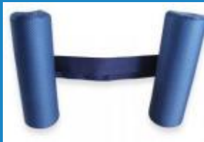
Side Support Roles