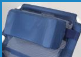
Delta Head Rest