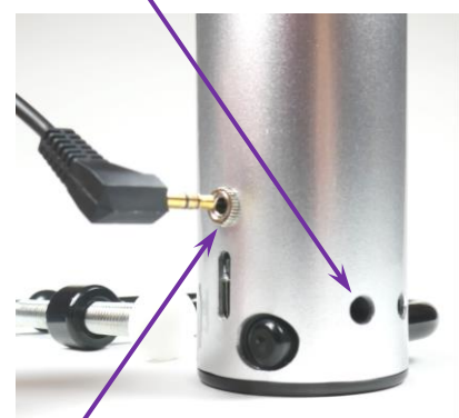
Switch Socket - H Suitable for standard switches with 3.5mm jack plug, including head or foot switches.

These holes enable alternative ways of mounting the device. They are compatible with our wheelchair Cup Holder (ND-MKV) .