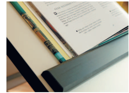
Close contact Even when using the arm support you can still get close to the table.