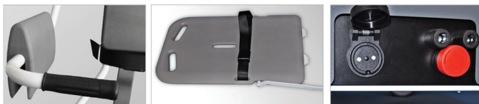
Comfortable back rest that can easily be moved to either arms for back support.