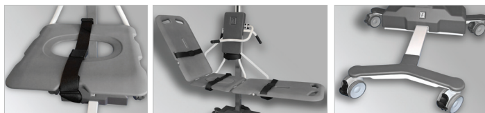
Commode seat on chair can be converted to smooth seat with lid placement.