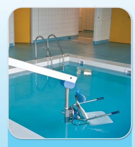
Pool hoist with chair