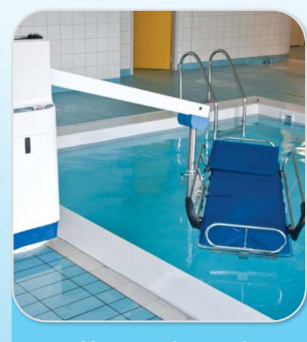
Pool hoist with stretcher

Installed in any pool environment with a solid floor, the Reval Poolside Hoist may be adapted to incorporate a chair or stretcher system, significantly reducing manual handling risks for caregivers and providing a safer environment for patients.